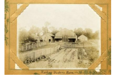
1851- LaGrange Co, IN

-Stopher Photo Center Lagrange, the Photographer who took the 1983 Reunion photo will be present the night of the main banquet program (6 July) to take an official reunion photo. They will be available to take additional group photos on request.