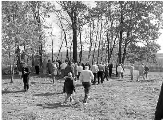
VISIT TO OLD YODER CEM.