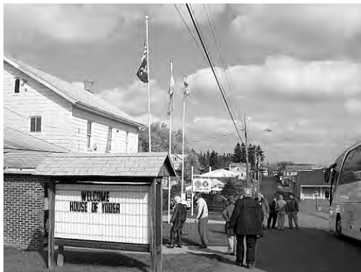
LUNCH AT BERLIN, PA FIRE HALL