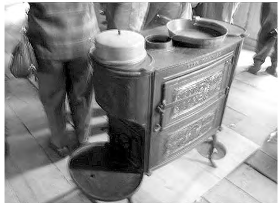
COOK STOVE OF DAVID Y YODER (YR26119)