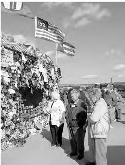
AT THE 9-11 MEMORIAL IN SHANKSVILLE, PA