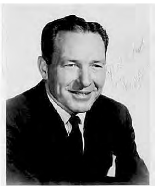
Los Angeles Mayor Sam Yorty (1909-1998), sought Dem. Pres. nomination in 1972