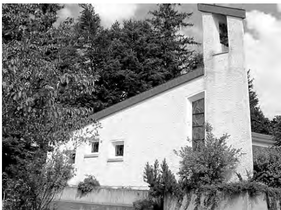
ST. JODER CHAPEL AT HERGISWIL, SWITZERLAND