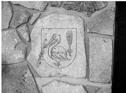
YODER CREST IN WALL OF YODER HOUSE