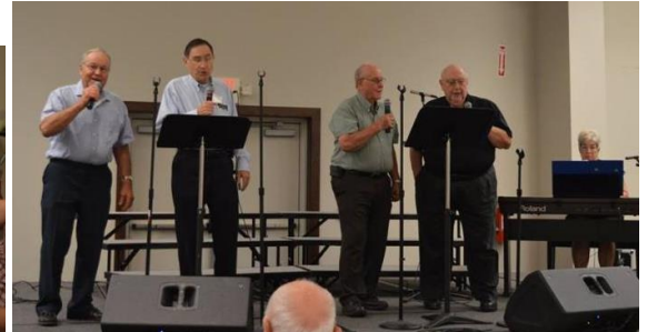
Yellow Creek Men's Quartet