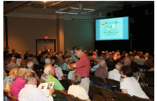
More of the Audience