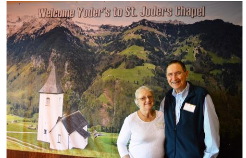
A Visit to the St. Joder Chapel