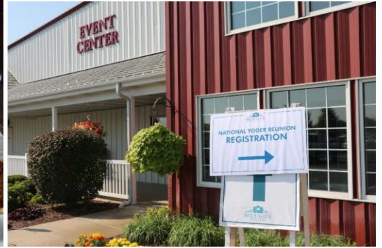
The Event Center