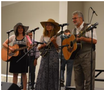
Schmidt's First Love