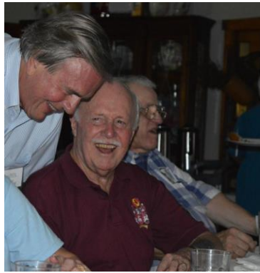
Plenty to Eat!