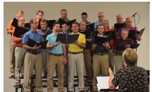
Emma Mennonite Men's Choir