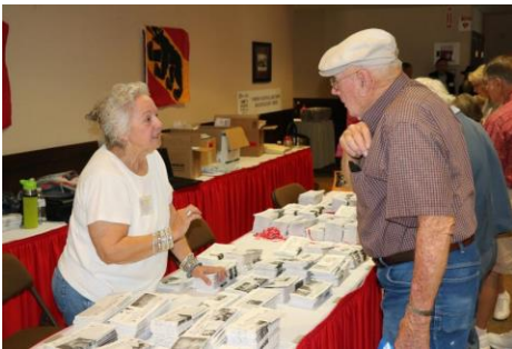
Registration Table