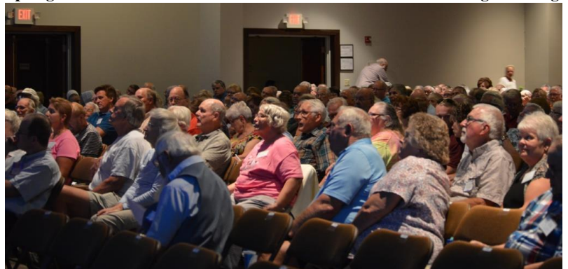
The Saturday audience at the Shippshewana Event Center