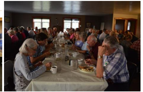
Amish Home Dinner