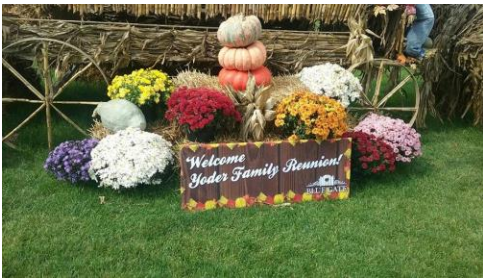
Welcome to Shippshewana