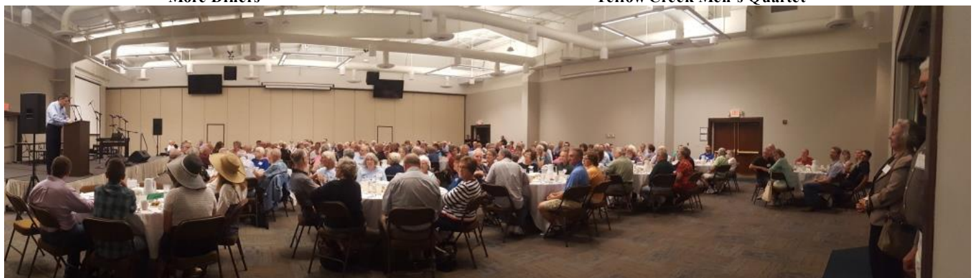
A Banquet Panorama