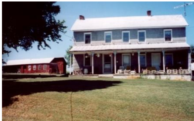
1742- Berks Co, PA