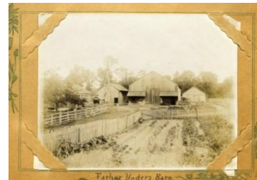
1851- LaGrange Co, IN

-Stopher Photo Center Lagrange, the Photographer who took the 1983 Reunion photo will be present the night of the main banquet program (6 July) to take an official reunion photo. They will be available to take additional group photos on request.