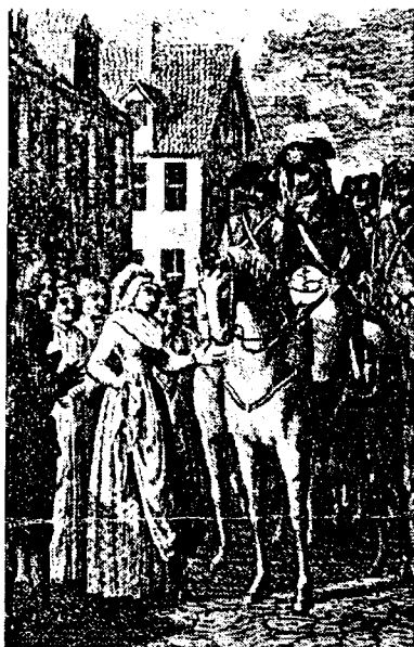
Der General Hoche und die froue Wittin zu Oggersheim.