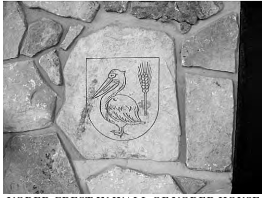
YODER CREST IN WALL OF YODER HOUSE