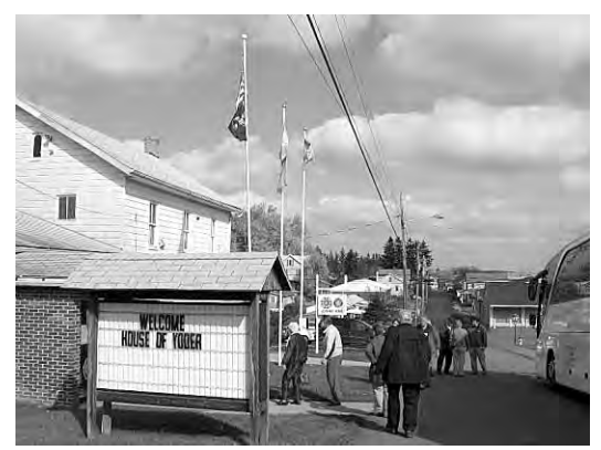
LUNCH AT BERLIN, PA FIRE HALL