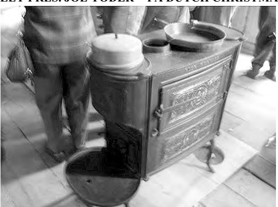
COOK STOVE OF DAVID Y YODER (YR26119)