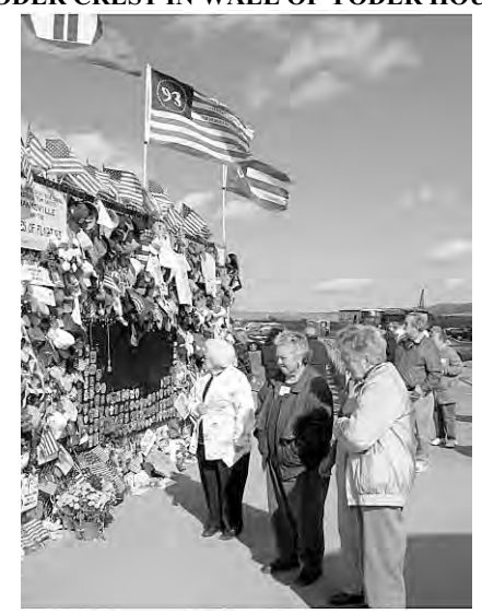
AT THE 9-11 MEMORIAL IN SHANKSVILLE, PA