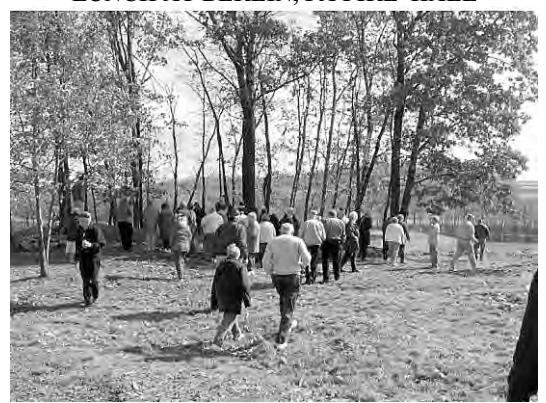
VISIT TO OLD YODER CEM.