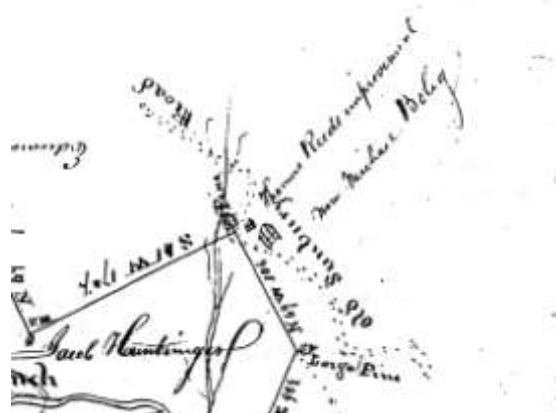
PROPERTY MAP, SHOWS STRUCTURE ON "OLD SUNBURY ROAD"