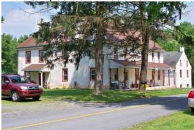
MAIN HOUSE WITH ITINERANT HOUSE BEHIND