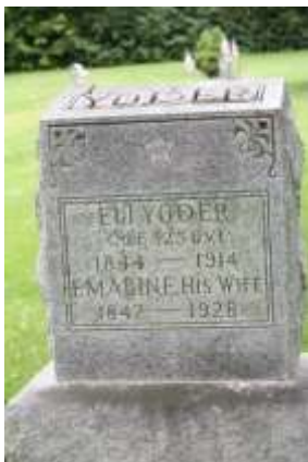
From the Melchior Yoder Line M2211- Eli b 7/12/1844 Greene Co, PA m 2/25/1866 Oberlain, Lorain Co, OH Emmeline Hutchinson d 2/13/1914 Leeburg Twp, Union Co, OH

A sample of posted gravestones is shown below.