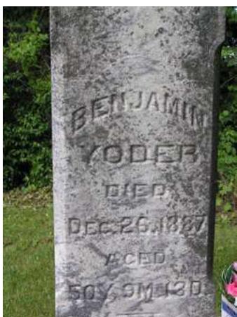
YRB661- Benjamin Yoder (3/13/1837- 12/26/1887) m 8/12/1858 Sarah DeWalt, Weasaw Baptist Church Cemetery Denver, Miami County, IN

A sample of posted gravestones is shown below.