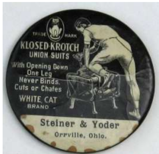
Klosed Krotch Union Suits from Steiner & Yoder, Orrville, OH, "Never Binds, Cuts or Chafes".