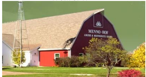
Menno-Hof, the Amish-Mennonite Story

Registration fliers will be sent out to YNL subscribers in the spring of 2017.