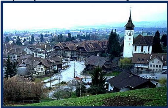
Steffisburg with the Old Church at right