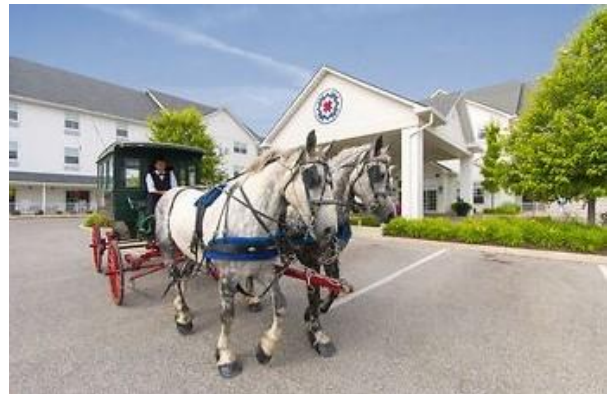
Blue Gate Garden Inn

- regional research opportunities will be available for Yoders whose family came through the area on their way to Iowa, Kansas, and elsewhere. These include: the Mennonite Library at Goshen College (19 miles); the Elkhart County Genealogy Society in Bristol (22 miles), The Northern Indiana Amish Library in Lagrange (c8 miles), the famous Allen County Public Library in Ft. Wayne (52-57 miles), and perhaps meetings with local historians and genealogists.